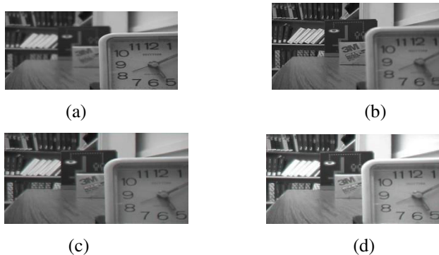
Fig. 3: (a) Input image 1 (b) Input image 2 (c) Fused image using DWT Approach (d) Fused Image using Proposed Approach

Mean is the average of all intensity value and higher mean denotes the good quality of image. Standard deviation gives the average contrast of the image. Higher standard deviation indicates good contrast of fused image. The MSE represent the cumulative squared error between the original image and reconstructed image. The lower the value of MSE, the error may be lower. PSNR used for quality measurement ratio between original image and reconstructed image. The higher the PSNR, the better the quality of the reconstructed image.